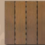
Colorado (12" x 12")

Wood species: Ipe (tabebuia sp.) Finish: pre-finished with protective oil. Plastic base: UV stabilized polyethylene. Packing: 12 tiles per box (6 for Double-C style)