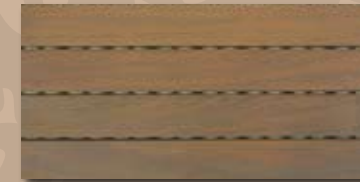
Double-C (24" x 12")