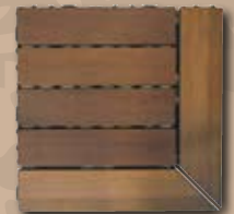
Corner reducers on tile

10 YEAR GUARANTEE: SwiftDeck tiles are fully guaranteed against faulty workmanship for a period of 10 years from the date of purchase. This guarantee however does not cover natural defects in the wood, misuse or if not installed and maintained as per manufacturer's recommendations.