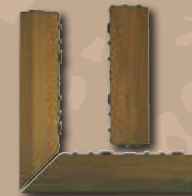
Clip on reducers for outside edges and corners