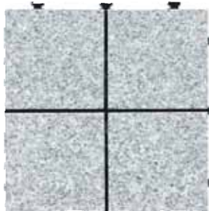
Rose Blush (quad)