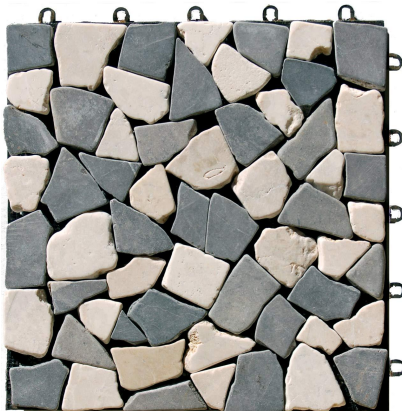
Grey & White